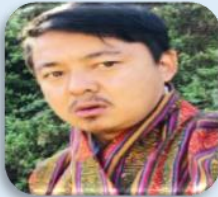
Nariyan SUBBA Offt GAO Udzorong Geowog 17321296