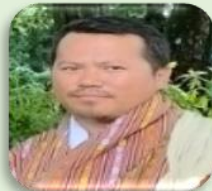
Thinley GAO Shongphu Gewog 17544317