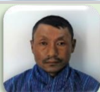
Karma KAKJAY Sweeper 17432115